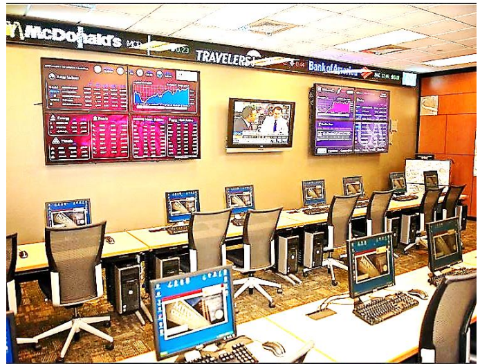
The financial laboratory concept and the type of content Stock Trak provides is described here:

Specifically, the transformation will add an electronic stock ticker and an LCD monitor/TV screen section to the classroom, so that most of the 300 students in Business & Investing and Financial Literacy will be able to see breaking business/stock market news live, as well as the results of stock market trading simulations in "real time." The hardware comes with additional software, upgraded annually, to support and expand the current curriculum. The annual software fee/upgrade will be handled by the HS as part of its curriculum budget.